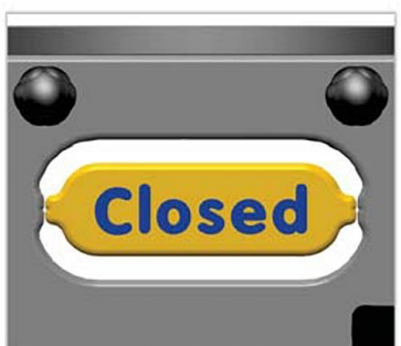
Rotating Open/Closed sign.