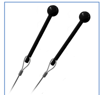
2x beaters per instrument