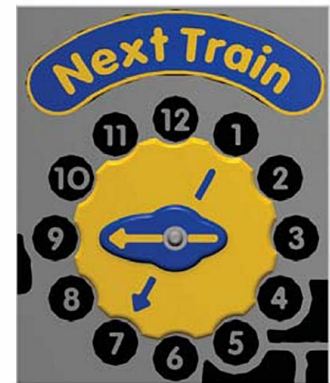
Rotating Clock Hands