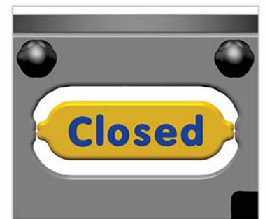
Rotating Open/Closed sign.